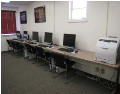
Pictured here, the computer literacy lab.

The Literacy and Computer Technology Program began in September 2007 with ten computer stations. The stations facilitate two groups of children from local schools ranging in age from 5 to 8 years old. The focus of the program is on education, literacy and technology. The program currently has a total of thirty children enrolled. The children all come from low income families where they are not exposed to literature or technology. Some of these students come from parents who are unable to help with their homework due to limited English. Most of these students enrolled in the program have low grades and the major problem observed is reading below grade level. One of the program's main goals is to expose students to literature so they can improve their reading ability. Funding for this project comes from UPS, Kaiser, California Wellness Foundation, the City of San Fernando and Verizon. A great deal of thanks goes out to our funding partners, staff and the children who attend.