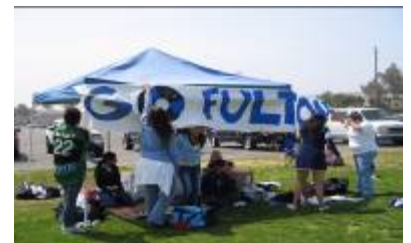
Bridges @ Fulton Program Valley Sports League

ECDA has been the lead agency for the City of Los Angeles Community Development Department (CDD) Bridges Program at Robert Fulton College Preparatory School in Van Nuys since 1997. ECDA has been providing youth achievement services, family foundation activities and community mobilization events to L.A. Bridges participants and their families. These developmental services include: individual and group counseling, recreational activities, organized sports, mentoring, anger management and/or conflict resolution training, tutoring/homework assistance along with life skills training and youth leadership groups. Families are provided with educational workshops, parenting support groups and case management. The L.A. Bridges program will be terminated on December 31, 2008 and a new gang reduction/youth development program will be implemented by Mayor Antonio Villaraigosa's office. An acknowledgement goes out to all the staff that worked under the Bridges program for a job well done.